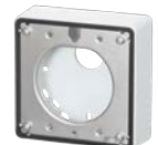
WV-QJB500-W Mount Bracket